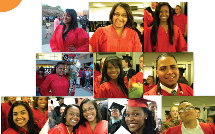
Our graduates from Salem High School Class of 2011.