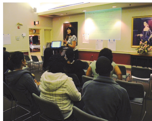
The June 22nd Parent Academy Workshop at The House of the Seven Gables.

ing seminar. Rising seniors will also be taken on college campus tours and all students will go on industry tours in order to learn more about different types of careers.