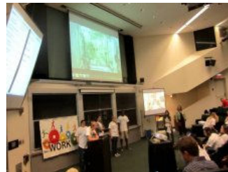
Competition at MIT, August 2011

programmed NASA's SPHERES robots, which are used on the International Space