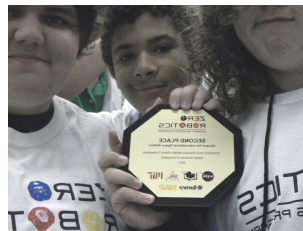
Second Place Finish

Salem CyberSpace was chosen by the Massachusetts After School Partnership and MIT to be one of only five youth programs to participate in the Summer of Innovation at MIT last summer. 15 middle school students learned how to program in "C", learned about physics, aerospace, math and engineering as they