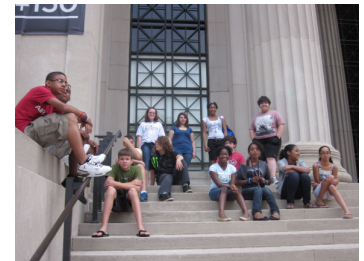
The Robotics Team at MIT