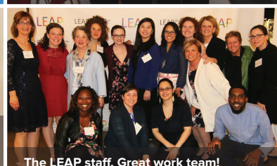
The LEAP staff. Great work team!