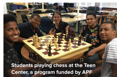
Students playing chess at the Teen Center, a program funded by APF