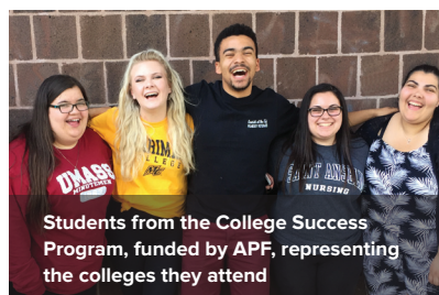
Students from the College Success Program, funded by APF, representing the colleges they attend