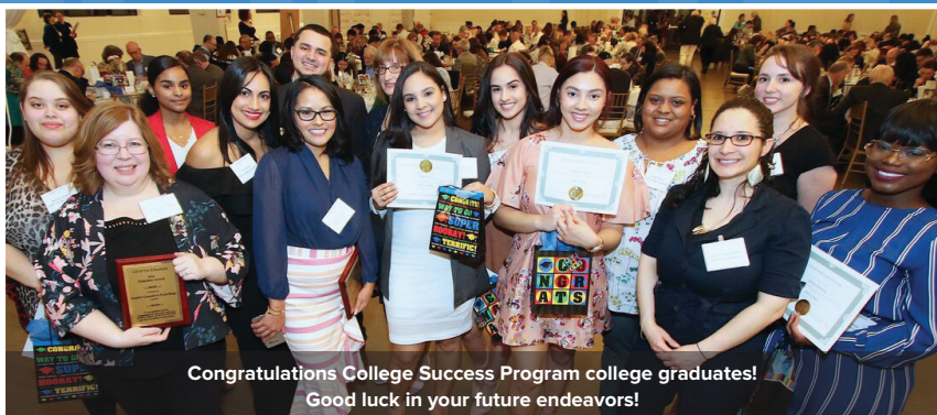
Congratulations College Success Program college graduates! Good luck in your future endeavors!