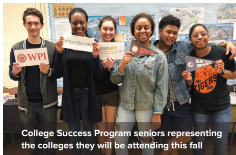
College Success Program seniors representing the colleges they will be attending this fall

Ten LEAP 10 th graders have been accepted into the Salem High School Early College Program. As part of this new and innovative program, 40 Salem High School students will receive 12 credits after completing four college courses. These credits will be applied to both high school and college graduation. This completely free program will offer college courses taught by Salem State University professors at Salem High School during junior year and on Salem State University's campus senior year. This program was collaboratively designed through a partnership between Salem State University, Salem High School, LEAP for Education and the North Shore Workforce Investment Board (WIB). LEAP and WIB staff will provide enhanced student college and career services at Salem High School during the school day and at LEAP's offices after school.