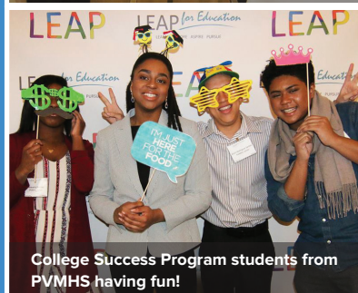
College Success Program students from PVMHS having fun!