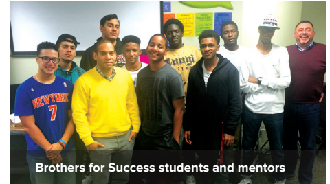
Brothers for Success students and mentors

Our peer-to-peer support groups, Brothers for Success and Sisters for Success, have become two of the most talked about programs in Salem. Brothers for Success which now has 12 engaged teens, was invited this year to join the 100 Males to College initiative with Salem State University. About eight Sisters are studying gender bias in the media through the Misrepresentation curricula.