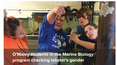
O'Maley students in the Marine Biology program checking lobster's gender