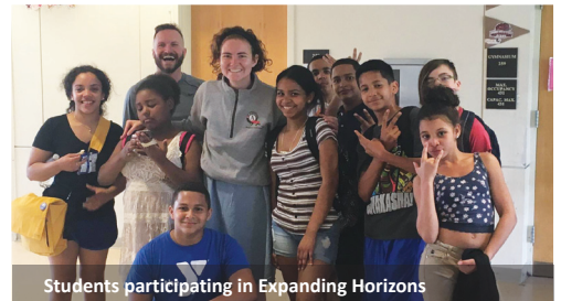
Students participating in Expanding Horizons

Thank you to the great group of Gloucester supporters who attended LEAP's Great Expectations event in April – we truly appreciate the volunteer hours, advice and financial support you give to our programs!