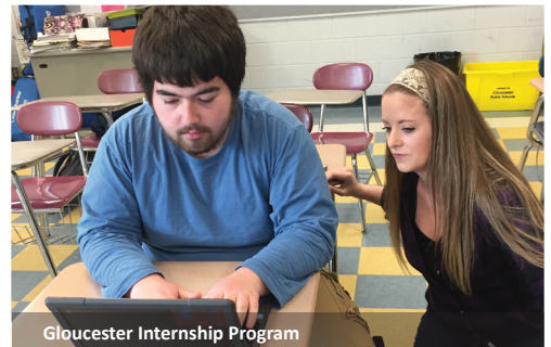
Gloucester Internship Program