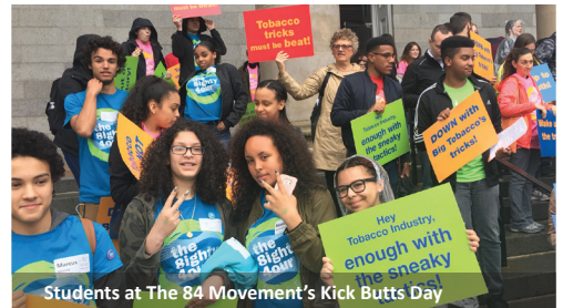
Students at The 84 Movement's Kick Butts Day