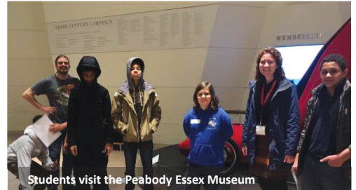
Students visit the Peabody Essex Museum