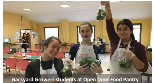
Backyard Growers students at Open Door Food Pantry